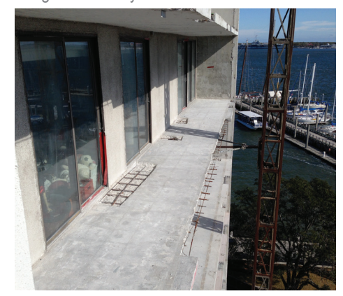
Concrete repairs in progress at balconies

Intricate repairs were required at some balconies where inadequate original construction was identified. The project was further complicated by the presence of existing hazardous coating materials which were either completely removed (abated) or were protected in-place to avoid being disturbed by the work.