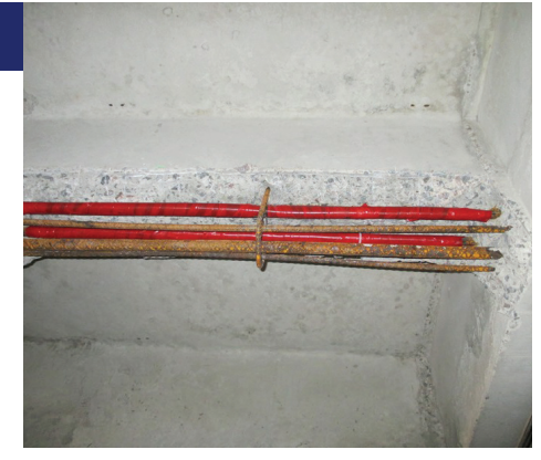
Post-tensioned beam repairs in progress