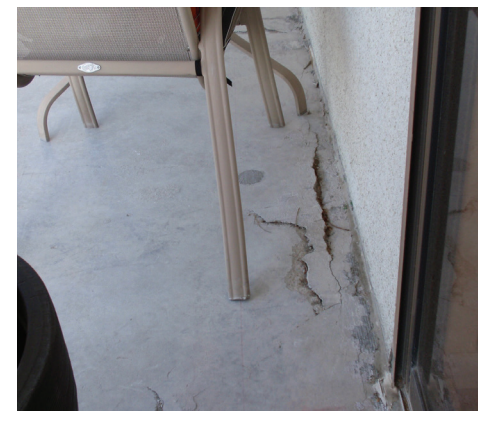
Reinforcing steel corrosion and concrete distress at balconies prior to repair