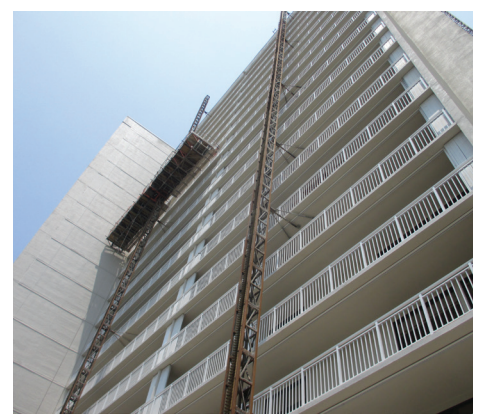
Mast climbers used to access balconies for repairs

Two contractors simultaneously performed the work that was divided between the concrete repairs and coatings and cathodic protection. The contractors used mast-climbers to access balconies in a phased approach to minimize impact to the owners. Concrete repairs were conducted first, followed by installation of the ICCP system, a polymer-modified cement-based protective deck coating, new handrails, and finish coating systems to the balcony walls and soffits. Extensive coordination was required between the two design firms and two concurrently working contractors. Special considerations were required for replaced handrails and re-used shutters, coatings