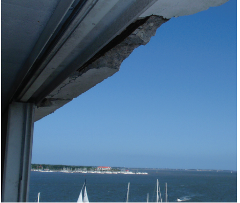
Slab edge distress and overhead spalling hazards prior to repair