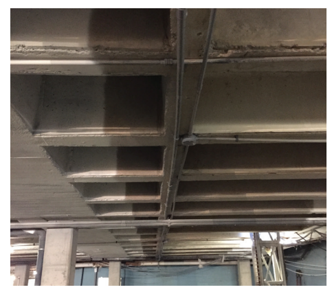
Thermal spray cathodic protection by the System Provider at garage components under the building