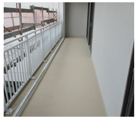
Finished balcony showing new guard rails, completed repairs and new deck coatings