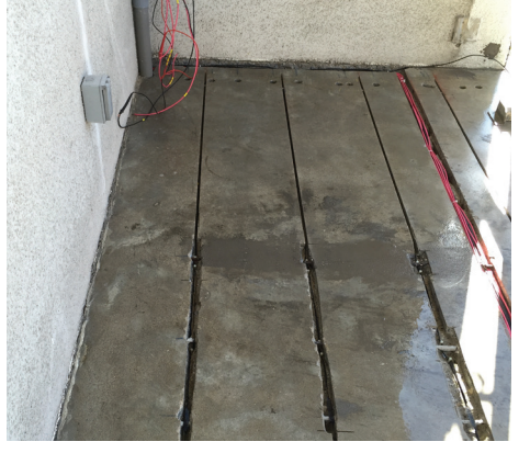
Impressed cathodic protection system installation in progress at balconies